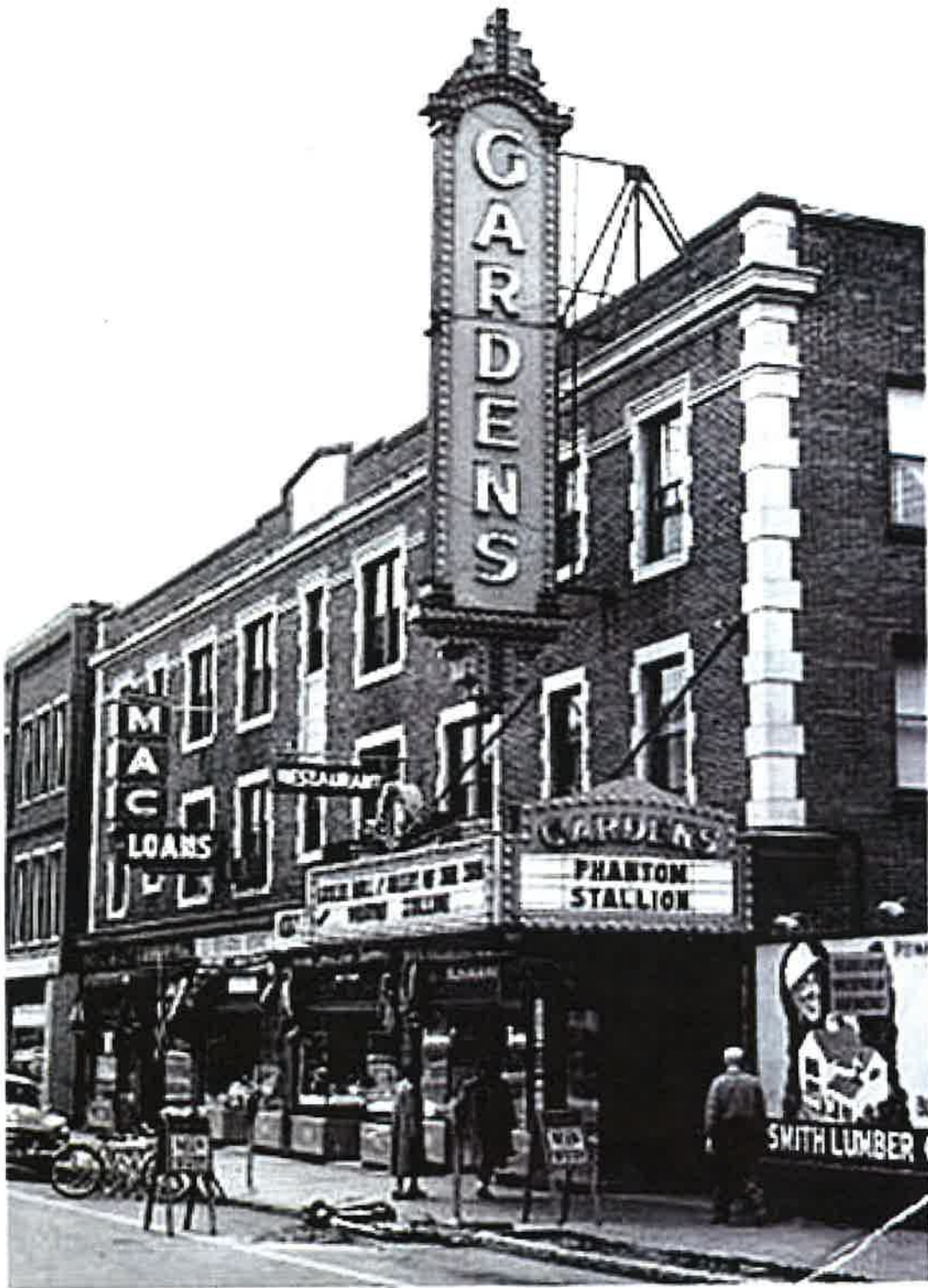
Photo of Laconia Gardens theatre, 1954.